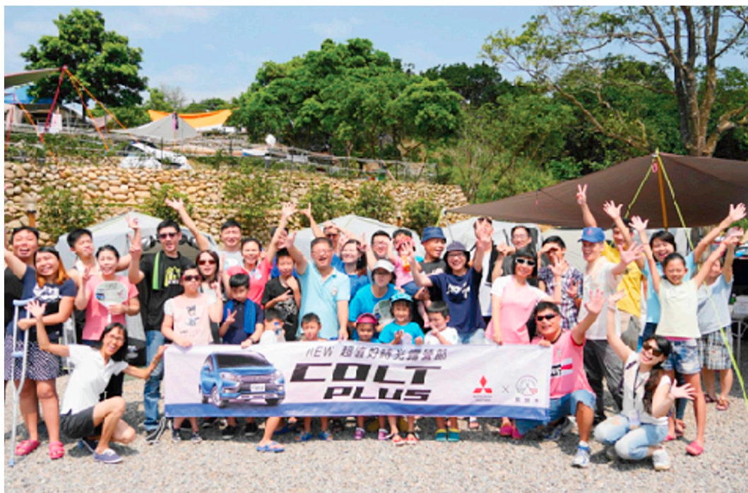
Fig. 3. Creative IoT marketing strategies of this case firm.

Delta has become a leading thermal and power management solutions provider in Asia, Europe, the Americas, and emerging markets. Its solid corporate culture targets the pursuit of sustainability, which is spread around all its business units, through innovation and development of new products and technologies, especially those with high efficiency and energy savings. It delivers superior performance by making use of its global value networks and by collaborating with other companies to achieve mutual goals.