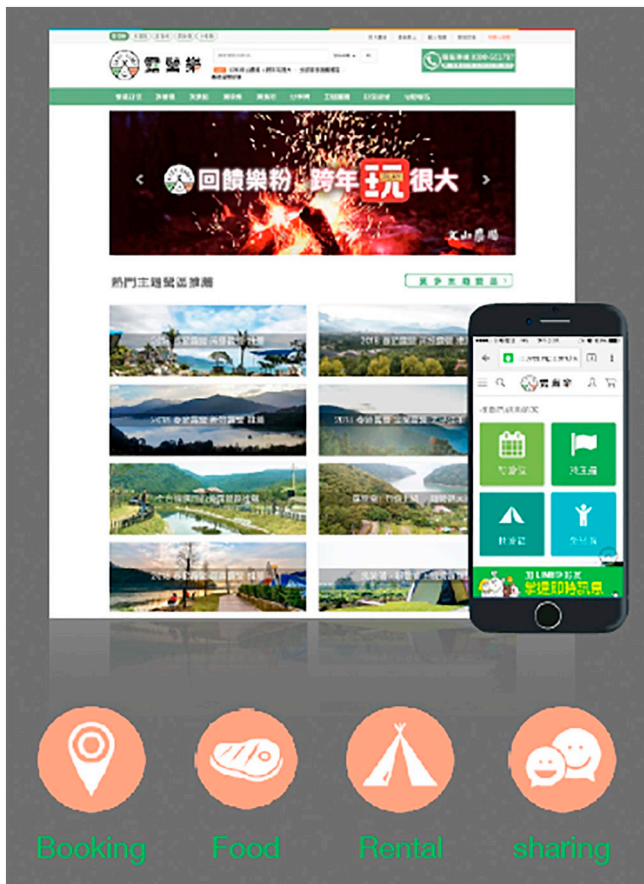
Fig. 2. IoT marketing strategies of the case study.

automobile brand producers, such as New COLT Plus (see Fig. 3). The firm uses the online community power of the automobile brand to connect with existing brand owners and to search for new ones.